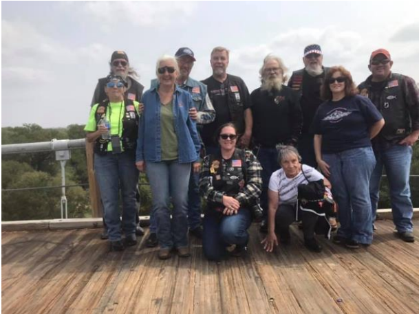
Chapter Ride – San Saba