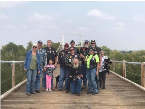
Mystery Run – Babes' Granbury